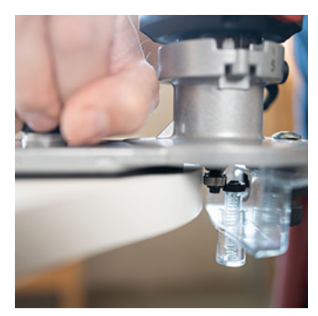
With sensitive materials, a friction ring brake prevents ugly machining marks.