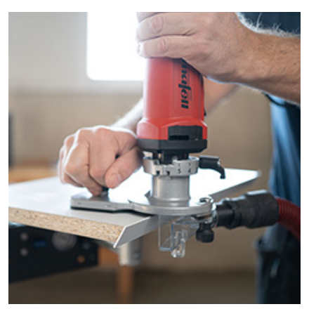
Large contact table allows steady machining, even of beveled edges.