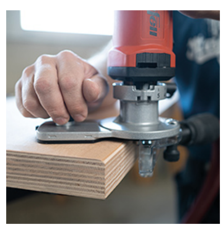
Even solid wood edges can be machined with commercially available cutters.