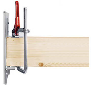
Perpendicular or angled joints on floor joists or rafter (roof system).