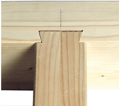
Dovetailed joints on floor joists or rafter (roof system).