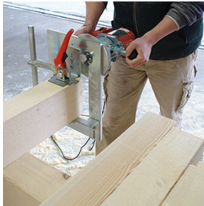
Speed: 8 to 18 mortise/tenon joints per hour.