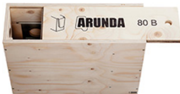
The Arunda system is delivered in a practical wooden box.