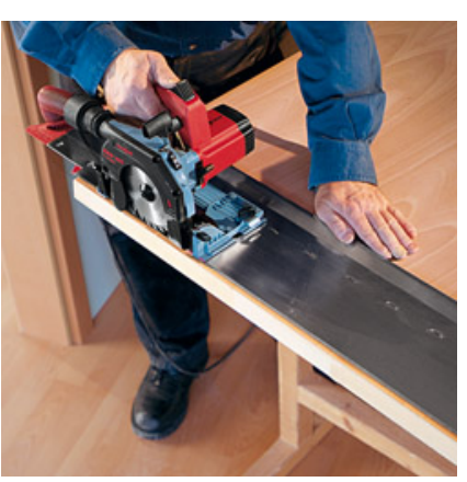
In combination with the roll-up Flexi-Guide FX 140, precise guided cuts up to 1.4 m (4.6 ft) long can be executed with consummate ease.