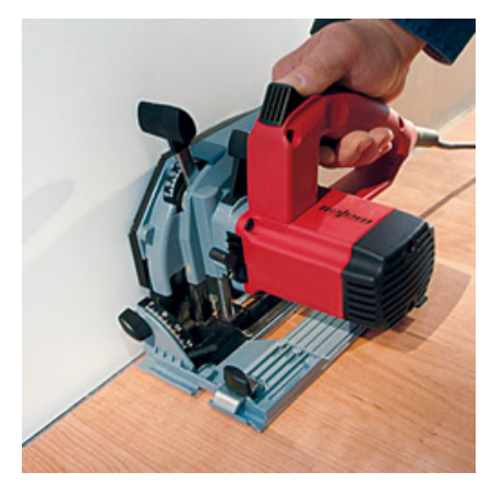
Perfect edging: the circular saw's spacers enable you easily to make exact expansion joint cuts with widths from 13 mm (1/2 in.).