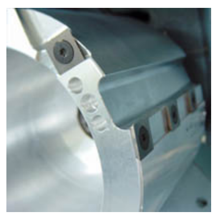
New cutter head with reversible carbide tips for extreme machining rates and optimum chip removal.