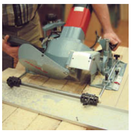
The ZK 115 Ec with the guide rail.