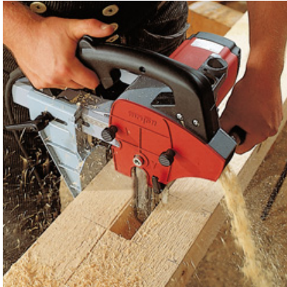
Tenon cuts of various sizes up to 100 mm (3 15/16 in.) with the LS 103 Ec.