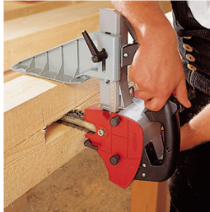
The LS 103 Ec being operated horizontally.