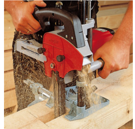
The LS 103 Ec with the guide support stand FG 150 for mortising depths of up to 140 mm.