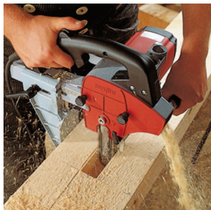
Tenon cuts of various sizes up to 100 mm (3 15/16 in.) with the LS 103 Ec.