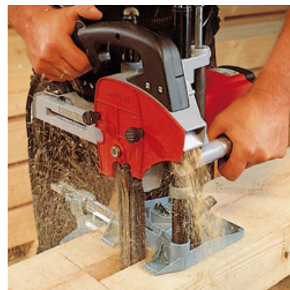
The LS 103 Ec with the guide support stand FG 150 for mortising depths of up to 140 mm.