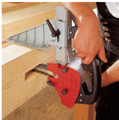
The LS 103 Ec being operated horizontally.