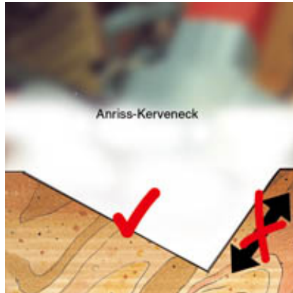
Unsurpassed precision – approved right-angled height adjustment. Distance of noches always constant irrespective of wood tolerances.