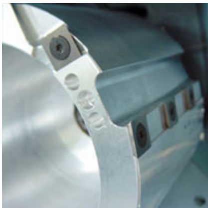
New cutter head with reversible carbide tips for extreme machining rates and optimum chip removal.