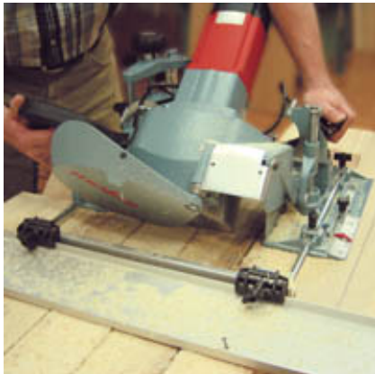
The ZK 115 Ec with the guide rail.