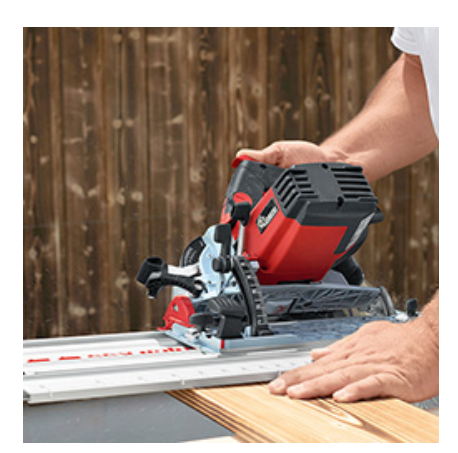
Thanks to the generously-sized angle scale, miter cuts can be realized that ensure a perfect fit.