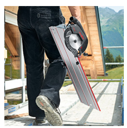
In view of their low weight, the 18 V versions are perfect companions when working on site. The innovative, high-capacity battery technology delivers stamina and tremendous power.

This product is part of the Cordless Alliance System. CAS means: One battery, many solutions. 100% compatibility of machines, battery packs and chargers!