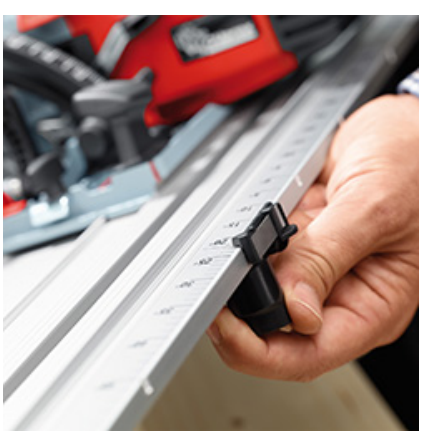
The highly graduated scale permits very precise angle setting.