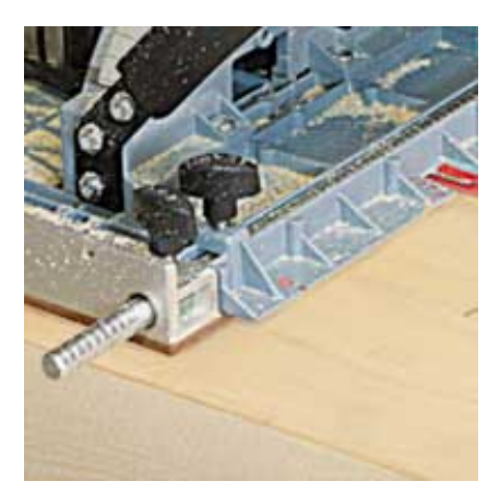
Perfect height adjustment. The Pertinax glider allows a compensating adjustment to be made for the thickness of the guide rail.