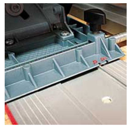
Especially precise, guided cuts are easy to execute because the ZSX-TWIN Ec is compatible with the existing MAFELL guide rail system F.