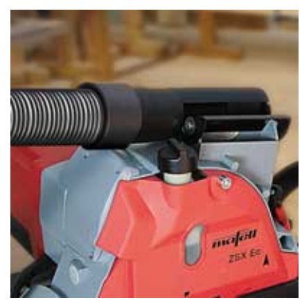
Since a large volume of chips can be produced at cutting depths of up to 400 mm (15 3/4 in.), the ZSX-TWIN Ec can also be used in conjunction with an extraction system.