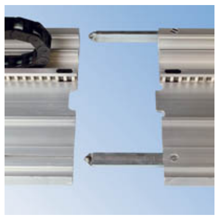
The guide rail is separated quickly and easily with the supplied hexagon key driver - a great aid to transportation.