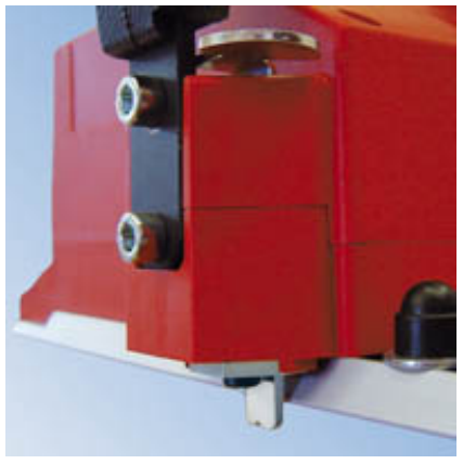
Ensures seamless cuts even in long workpieces.