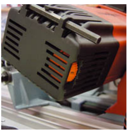
Setting wheel for speed adjustment for various materials.