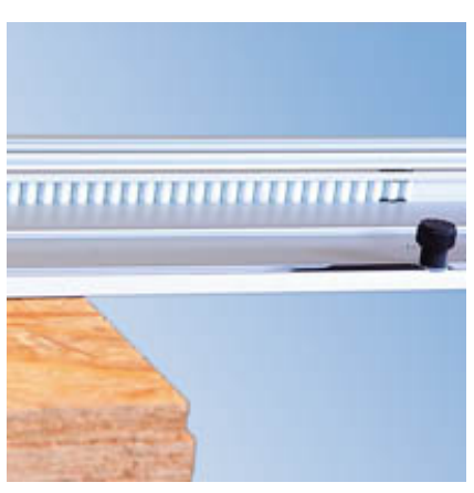
Adjustable stop ensures compliance with desired cutting