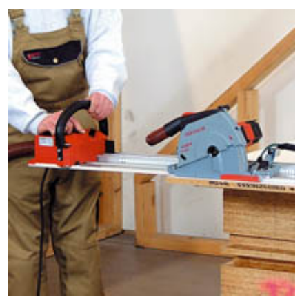
Due to the saw feed motor and convenient one-man operation panels can be cut easily and fast.