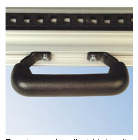
Easy to carry by adjustable handle integrated in rail.