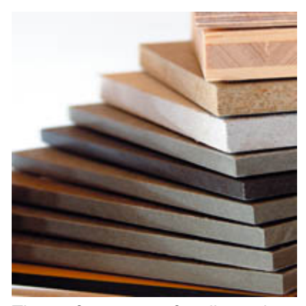
The perfect system for all panels from e.f. particle boards up to cement fiber panels.