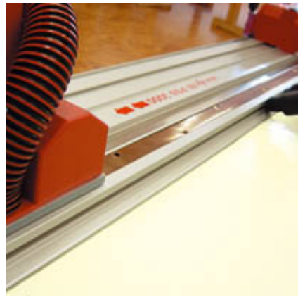
In conjunction with the integrated suction channel and the S 50 M, it eliminates practically all of the dust particles that occur.