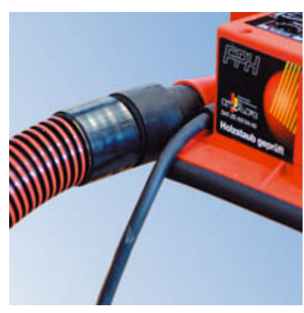
For a practically dust-free environment. Compatible with the MAFELL dust extractors S 25 M and S 50 M.