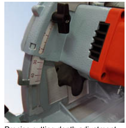
Precise cutting depth adjustment due to an exact scale.