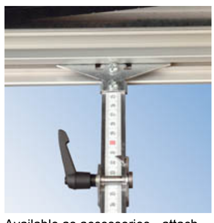
Available as accessories - attach easily to the guide rail of the PSS