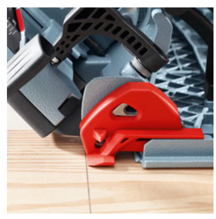
The innovative pointer automatically follows the machine as it is tilted and therefore always accurately tracks the actual cutting edge.