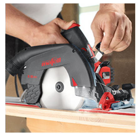
Dispensing with a detachable riving knife, the FLIPPKEIL permits reliable, convenient and straightforward plunge cutting.