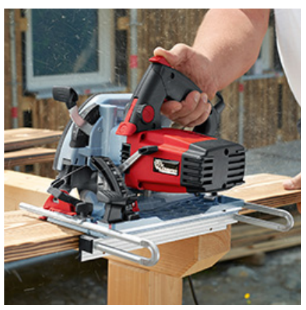
Using the MAFELL guide rails or optional edge guide, which is graduated in millimeters, decking boards can be made to fit exactly.