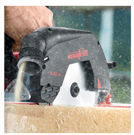
The chips are carried away so efficiently that the vacuum channel cannot become blocked. Users enjoy this crucial benefit when executing plunge cuts in the direction of the fibers as well.