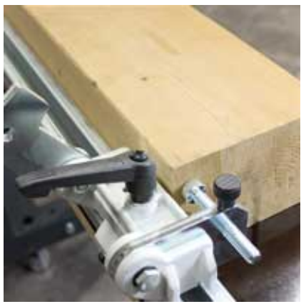
The 3 m (9.8 ft) long support profile with mm scale and length stop allows precise positioning of the workpieces.