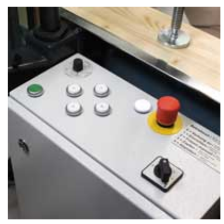
Clear, transparent layout – the controls of the ZAF 250 Vario for automatic or manual operation.