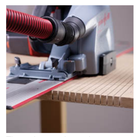
Three slots can be cut in one pass with the MF-SE 3. This quick and simple bending technique is applied to produce curved elements.