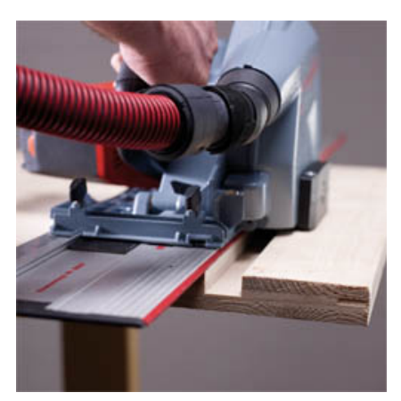
Equipped with the MF-VN 25, the multicutter can produce grooves for risers or service ducts efficiently and quickly.