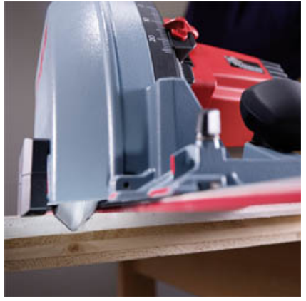
The MF-GF 90/15 cuts 90° V-grooves with very little dust; by gluing the cut faces, sturdy corner paneling is produced in just a few steps.