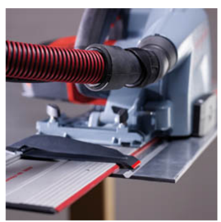
The MF-AF 90 can be used for routing and folding techniques, as applied in facade construction and with sign boards.