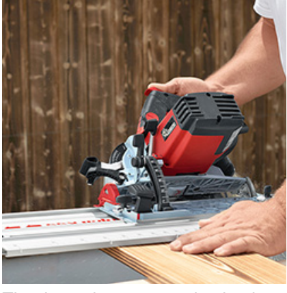
Thanks to the generously-sized angle scale, miter cuts always ensure a perfect fit – as seen here with exterior cladding.