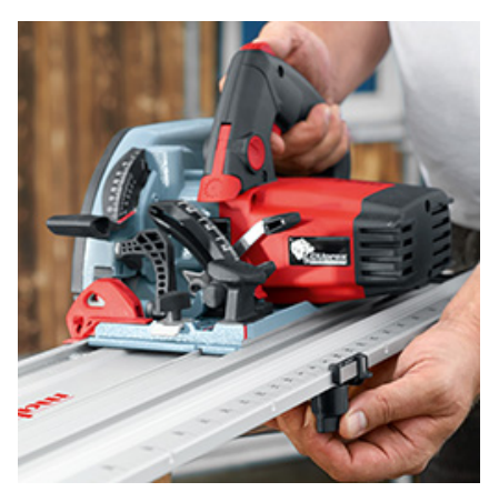
The highly graduated scale permits very precise angle setting.

This product is part of the Cordless Alliance System. CAS means: One battery, many solutions. 100% compatibility of machines, battery packs and chargers!