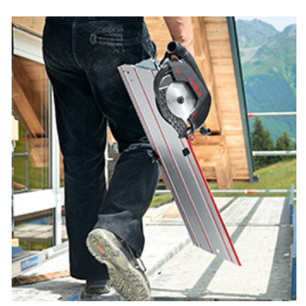
In view of their low weight, the 18 V versions are perfect companions when working on site. The innovative, high-capacity battery technology delivers stamina and tremendous power.