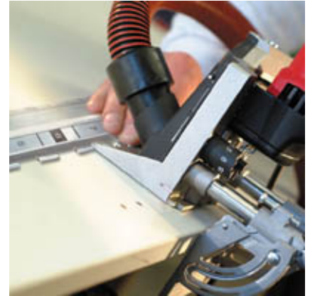
Quick and economical: Making carcasses with the DD40 and dowel template.