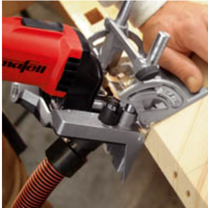
Fast and accurate: Edge-to-edge and mitre corner joints.