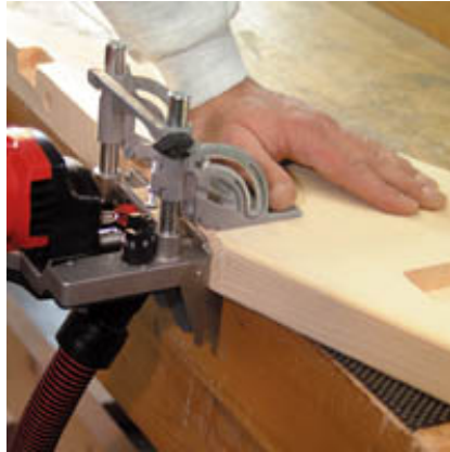
For use in staircase construction, in the workshop and on site.