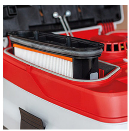
The particularly effective filter system with automatic filter dedusting has been specifically adapted to the work with power tools.