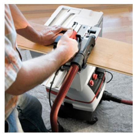
Once secured to the appliance, the T-MAX can serve as a bench for small workpieces.