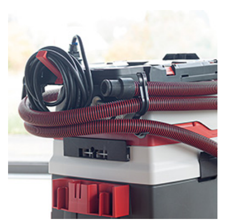
New additional function: Easier and safer hose winding due to integrated cable hook with plug locking device at the adapter plate.