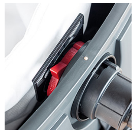
New rotary vane at the outlet connection which will also allow the use of PE disposal bags in the future.