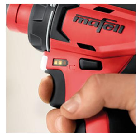
The battery charge indicator is situated on the side for permanent visibility.