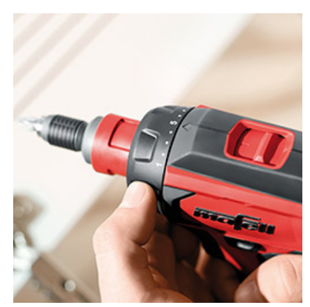
The 20 torque settings are easy to select with the locking collar.