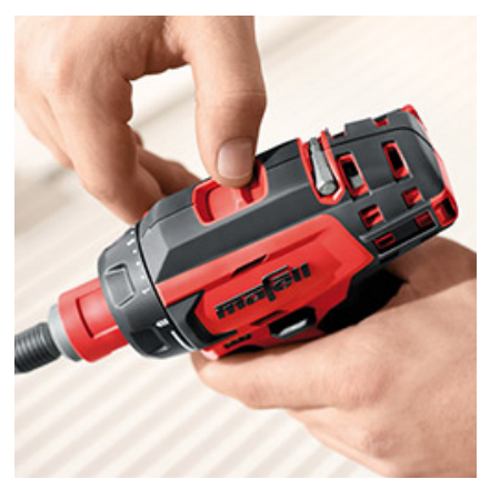
Maximum torque of 34 Nm makes the A 10 M a highly capable all-rounder.